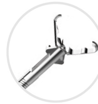
Forceps with rat teeth