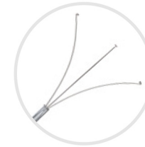
Forceps with prongs