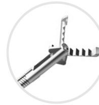
Forceps with alligator teeth